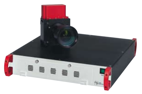
Leica RCD105 – a purpose-built medium format airborne imaging system

The new Leica RCD105 adapts readily to changing job situations, providing imaging performance and integration convenience for concurrent LIDAR/image data needs.