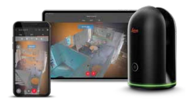
Leica BLK360 3D laser scanner and Leica Cyclone FIELD 360 mobile-device app.

Download from Google Play Store and Apple App Store.