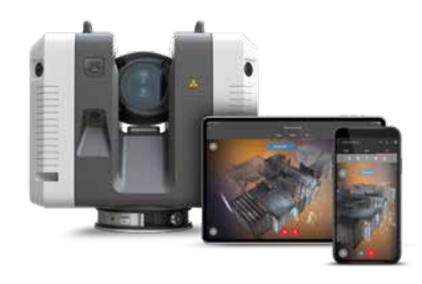
Leica RTC360 3D laser scanner and Leica Cyclone FIELD 360 mobile-device app.