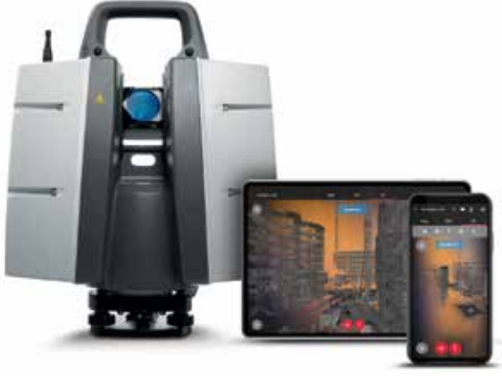
Leica ScanStation survey-grade, 3D laser scanner and Leica Cyclone FIELD 360 mobile-device app.