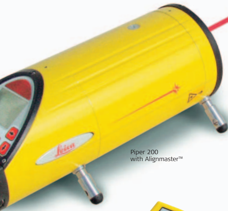
Piper 200 with Alignmaster™

Patented automatic targeting system searches and finds the target for second day setups.